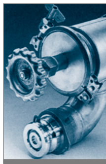
OPW's 2173AVN Dry Disconnect Coupling installs on the QRB valve on the truck