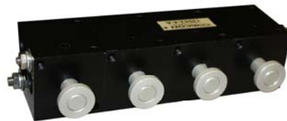
12053-4 -A (Shown)